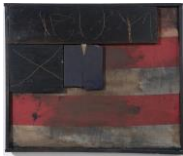
Hannelore Baron , American b. 1926 Dillingen, Germany, d. 1987 New York, NY Untitled (B-8501 I) , 1985 Assemblage of flag and wood with paint Courtesy of Pavel Zoubok Fine Art, NY ©Estate of Hannelore Baron