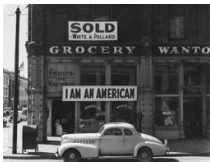
Dorothea Lange , American b. 1895 Hoboken, NJ, d. 1965 San Francisco, CA I Am An American , 1942 Photograph, printed 2020 Central Photographic File of the War Relocation Authority, National Archives Identifier 210-G-A35