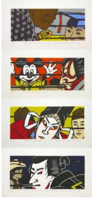
Roger Shimomura , American b. 1939 Seattle, WA, lives and works Lawrence, KS Yellow No Same #8, #9, #10, #11 , 1992 Part of a series of twelve ten-color lithographs