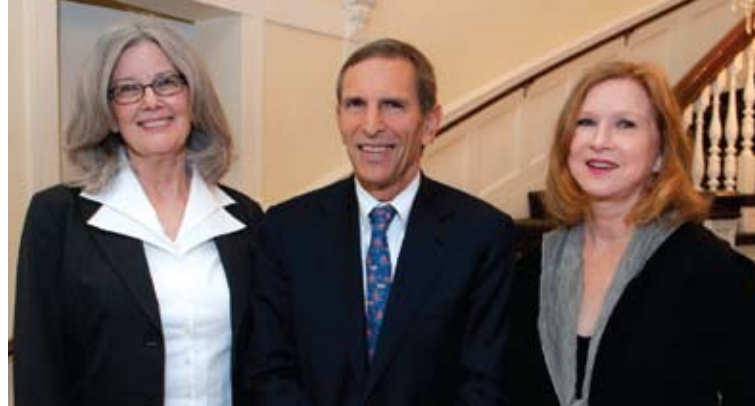
Literary Lunch authors Elizabeth Berg, Ben Cheever, and Sue Miller

$10 members, $20 non-members each Saturday