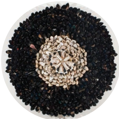
Willie Cole The Difference Between Black and White , 2005-06 Shoes, wood, metal, and staples 85 inches diameter x 16 inches deep