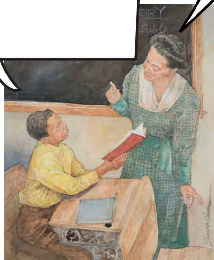
Jerry Pinkney from God Bless the Child