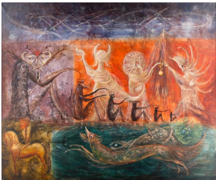
Leonora Carrington, Sueño (Nephes as the Soul in a State of Sleep) , 1959. Oil on linen. 49 ½ x 59 x ½ in. (126 x 150.2 cm). Private collection. ©Leonora Carrington / Arts Rights Society (ARS), New York.

(Katonah, NY, July, 2025) — The Katonah Museum of Art (KMA) is proud to announce the opening of two distinct exhibitions, both on view from July 13 to October 5, 2025.